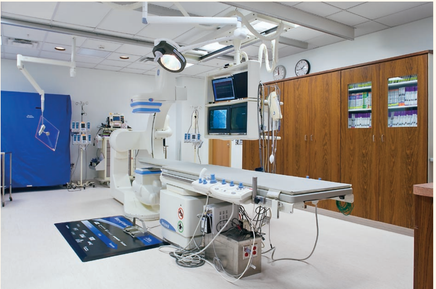
The Heart Center is a self-contained unit within one geographic area of Affinity Medical Center. The ORs are just steps away from the cath labs (one of which is shown here) and the cardiac ICU, and the Emergency Department is right around the corner. Best of all, there's room to grow.

physicians, all cardiology groups, the surgeons and the anesthesiologists. A committee comprised of the above provided input to hospital administration to assist with the design of the new Heart Center.